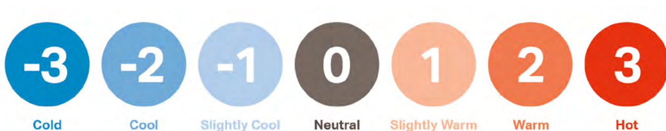
Figure 1: Fanger model based thermal comfort scale [38]

The standards most commonly used to predict thermal comfort, ASHRAE 55-2016 and ISO 7730, are based on the Fanger model [34,37] . The Fanger model calculates the predicted mean vote (PMV) and predicted percentage dissatisfied (PPD) of comfort for a group based on air temperature, mean radiant temperature, relative humidity, metabolic rate and clothing insulation. This can be simulated during the design process. [6] The PMV model adopts a seven-point scale from hot, +3, to cold, -3 ( Figure 1 ).