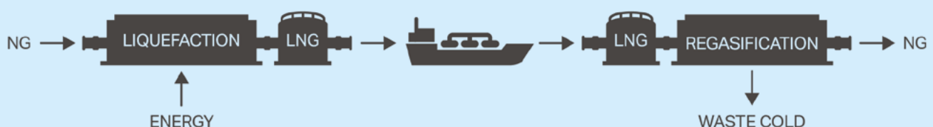
Figure 4: Simplified diagram of a typical LNG supply chain