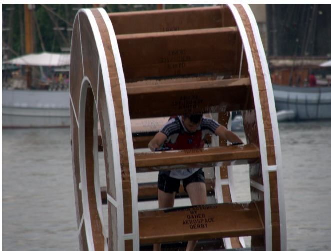
2014 winner of 'Most Spectacular Boat'