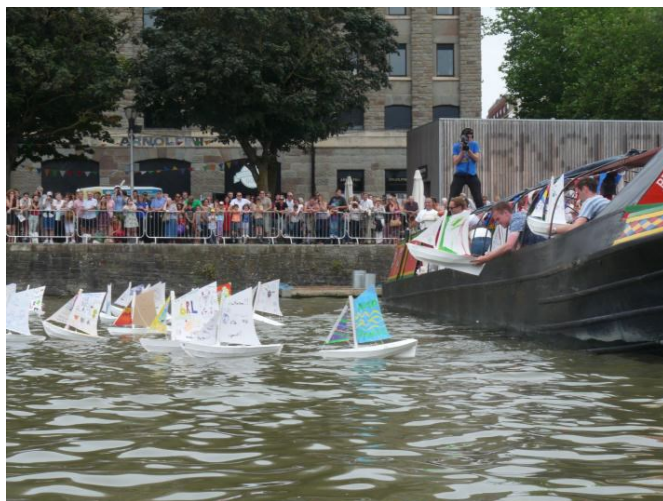
Launching the 'prettiest' boat first at the children's race