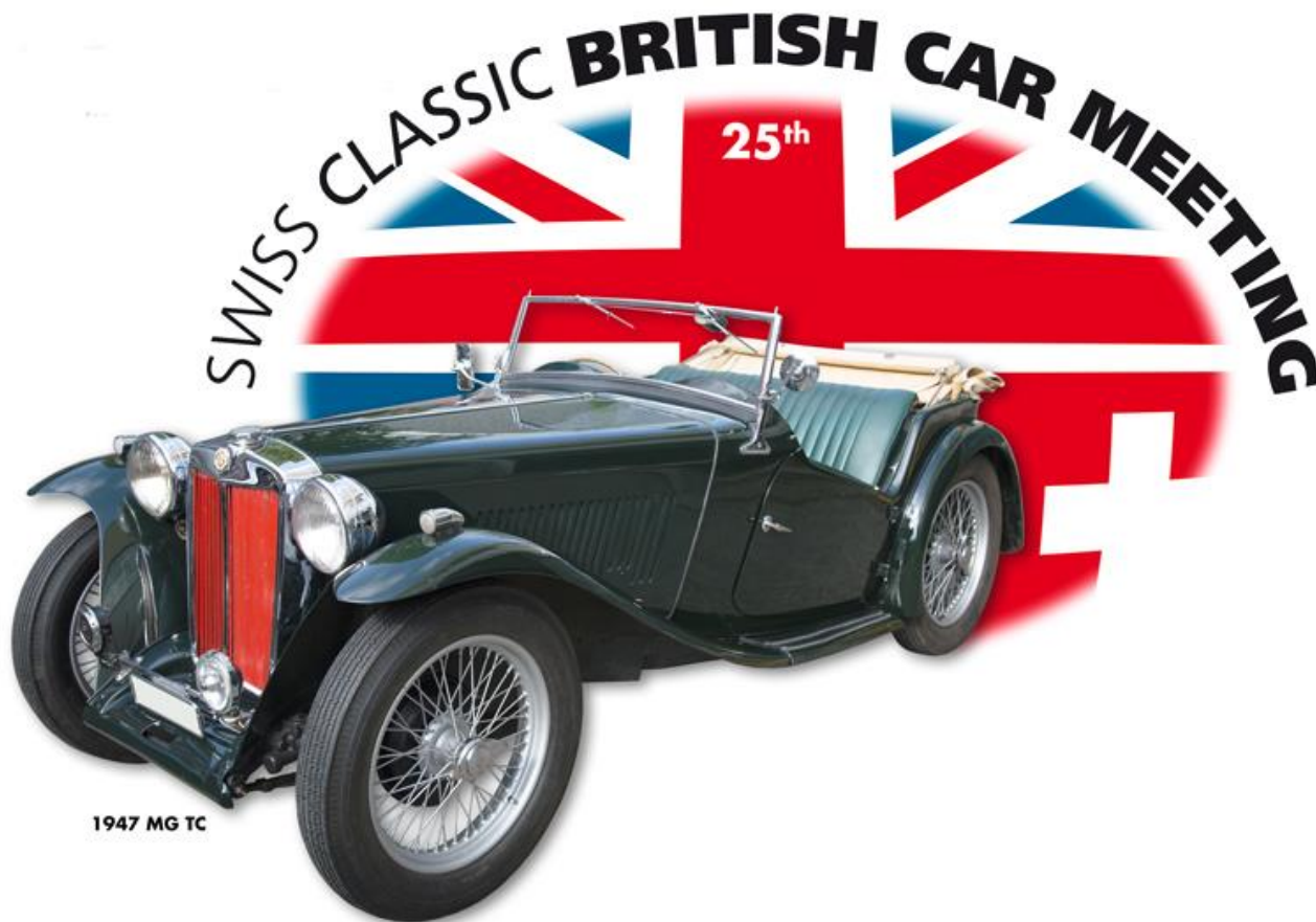
1947 MG TC